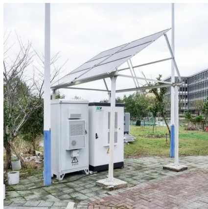
Battery Cabinet, Battery Storage Cabinet, Battery Bank Rack

We are proud to announce that Vision has successfully won the bid for a UPS lithium battery project in Johor Bahru, Malaysia. With outstanding product performance, strong ...