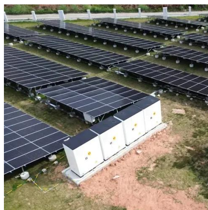
A pv panel transforms sunlight into usable energy, making it a critical component for powering telecom...