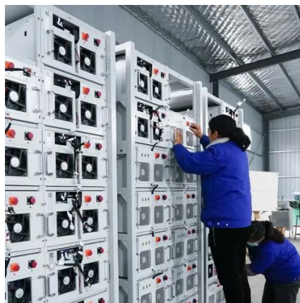
BESS 1MW 3.2MWh AC 480V Three Phase ...

The IP54-rated enclosure ensures dependable operation even in harsh environments. Consequently, with its robust features and exceptional ...