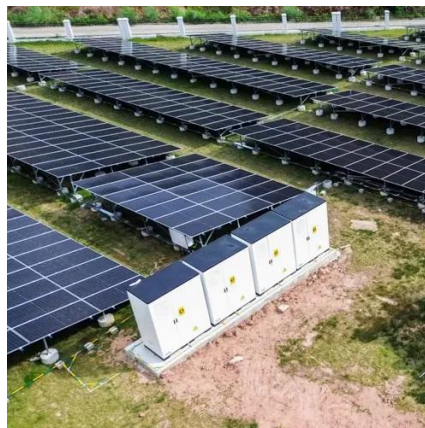
Our Lifepo4 batteries can be connected in parallels and in series for larger capacity and voltage.

A Battery Management System (BMS) is essential for the efficient use and longevity of lithium-ion battery packs. It guarantees safety and ...