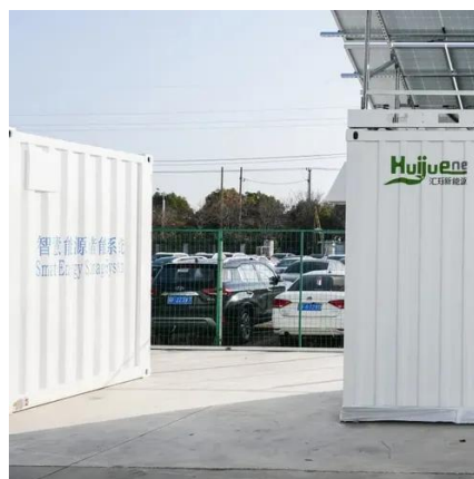
Commercial ESS 150kW/300kWh - EnSmart Power

AZE's All-in-One Energy Storage Cabinet is a cutting-edge, pre-assembled, and plug-and-play solution designed to simplify energy storage deployment while maximizing efficiency and ...