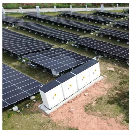
400v 200ah 80kwh Lithium LifePo4 battery pack for ...

Estimates the energy production and cost of energy of grid-connected photovoltaic (PV) energy systems throughout the world. It allows homeowners, small building owners, installers and ...